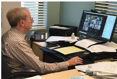
Speaking with families on a Zoom Family Support call.